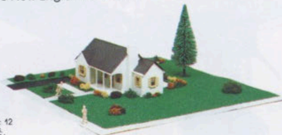
49-1986 New England Rancher $7.00