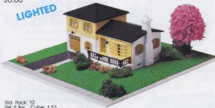
49-2572 Split Level House $6.00