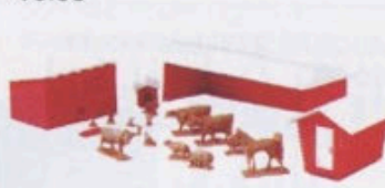
45-2652 Farm Buildings and Animals $3.00