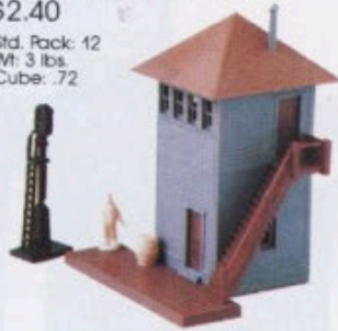
45-2632 Switch Tower $2.40