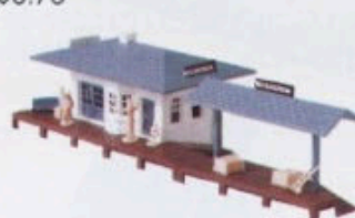
45-2673 Suburban Station $3.75