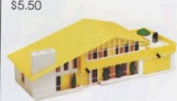
45-2932 Contemporary House $5.50