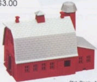
45-2651 Barn $3.00