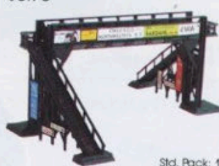
45-2672 Pedestrian Bridge $3.75