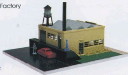
49-1988 Factory $7.00