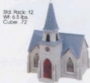
45-2692 Cathedral $4.25