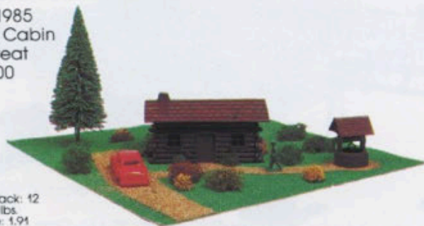
49-1985 Log Cabin Retreat $7.00