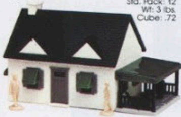
45-2631 Cape Cod House $2.40