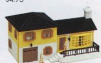
45-2713 Split Level House $4.75