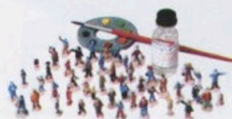
45-2712 48 Standing Figures with Paints $4.75