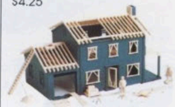
45-2691 House under Construction $4.25