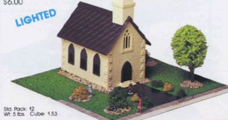
49-2576 Country Church $6.00