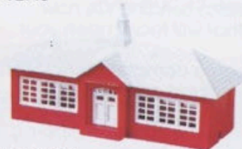
45-2633 School House $2.40