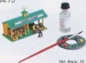
45-2715 Roadside Stand with Paints $4.75