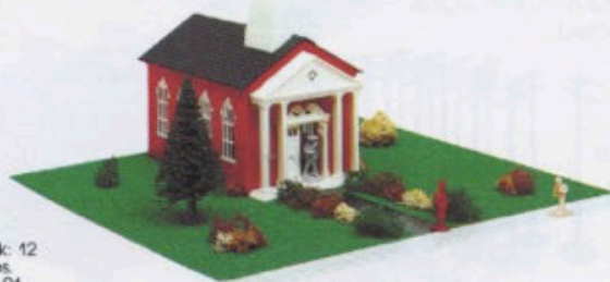
49-1984 Country Church $7.00