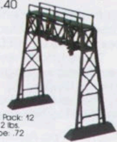
45-2634 Signal Bridge $2.40