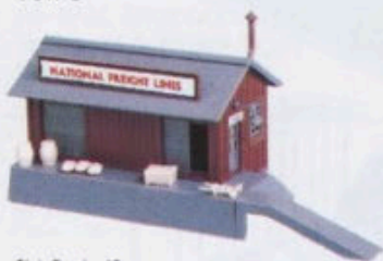
45-2671 Freight Station $3.75