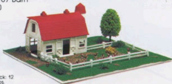
49-1987 Barn $7.00