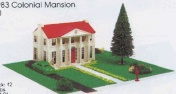
49-1983 Colonial Mansion $7.00