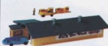
45-2928 Jiffy Car Wash $5.50