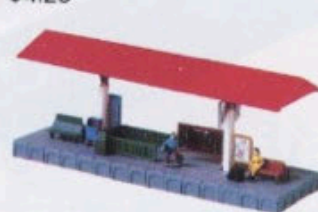
45-2694 Platform Station $4.25