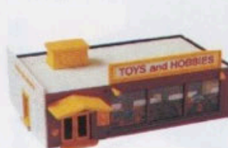
45-2931 Toy & Hobby Shop $5.50