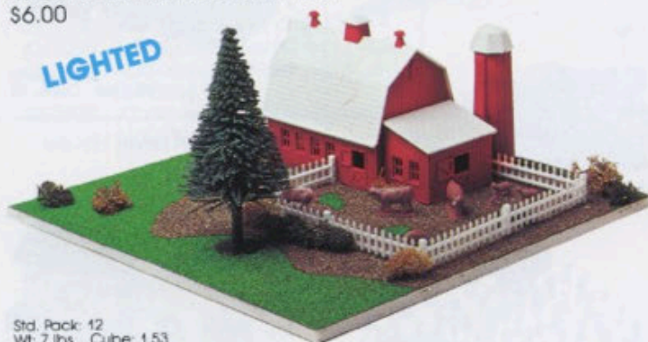
49-2573 Barn, Silo and Animals $6.00