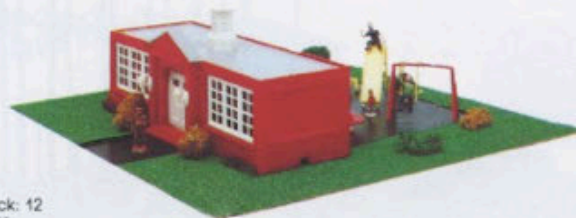
49-1982 School & Playground $7.00