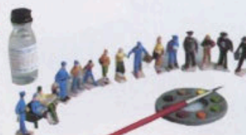
65-1955 32 Figures with Paints $6.00