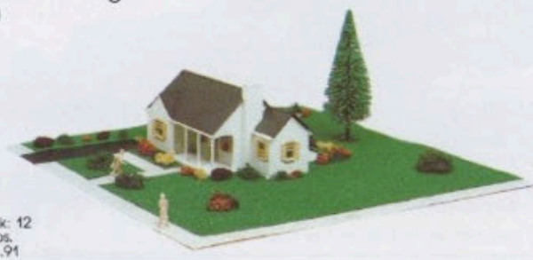
49-1986 New England Rancher $7.00