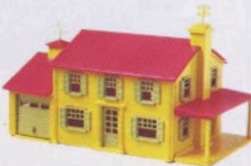
65-1936 Two Story House $5.00