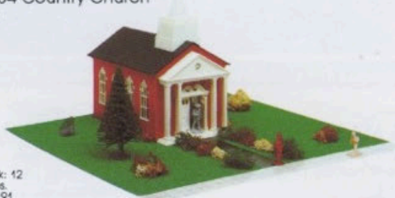
49-1984 Country Church $7.00