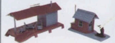
65-1952 Loading Platform and Watchman's Shanty $6.00