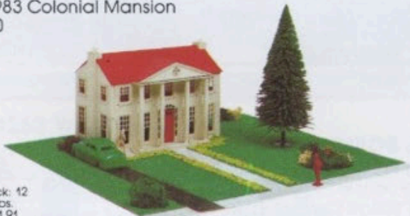
49-1983 Colonial Mansion $7.00