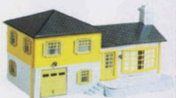
65-1953 Split Level House $6.00