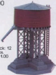
65-1935 Water Tank $5.00