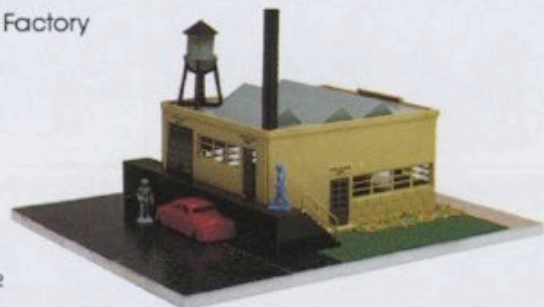
49-1988 Factory $7.00