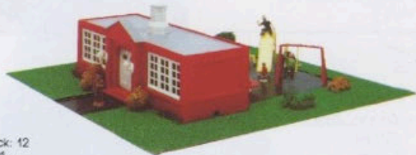
49-1982 School & Playground $7.00