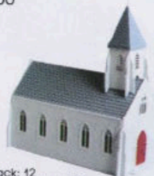
65-1933 Church $5.00