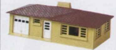
65-1934 Ranch House $5.00