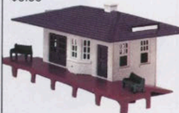
65-1954 Suburban Station $6.00