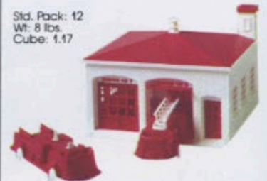
65-1956 Fire House $6.00