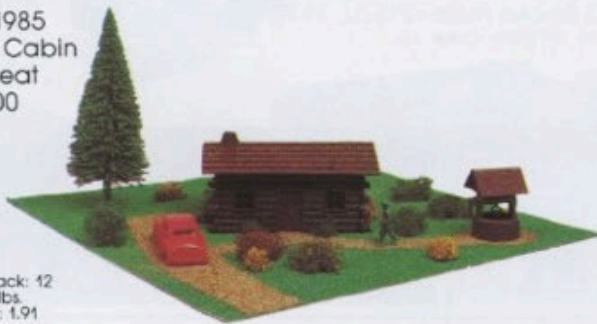
49-1985 Log Cabin Retreat $7.00