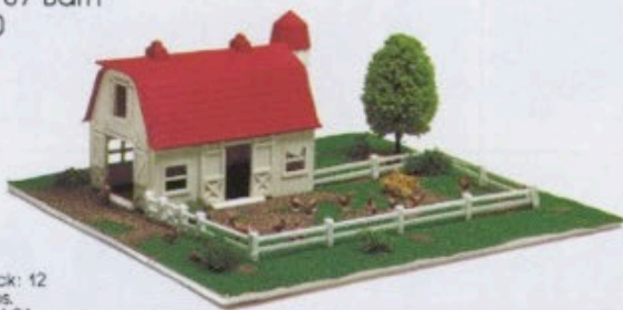
49-1987 Barn $7.00