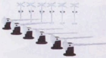
65-1937 Crossing Signals & Gates $5.00

65-1950 12 Piece $6.00 Kit Assortment $72.00 Std. Pack: 1 Wt: 7 lbs. Cube: 1.17