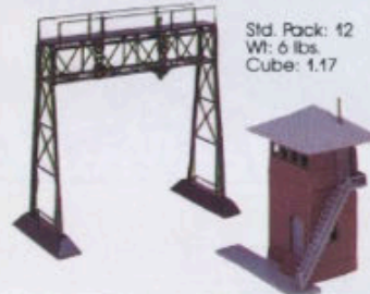
65-1951 Signal Bridge and Switch Tower $6.00