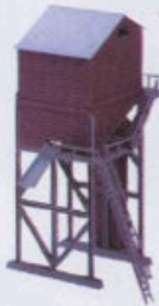
65-1957 Coaling Station $6.00