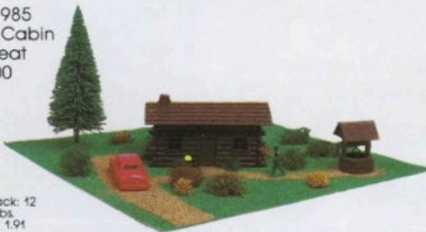
49-1985 Log Cabin Retreat $7.00