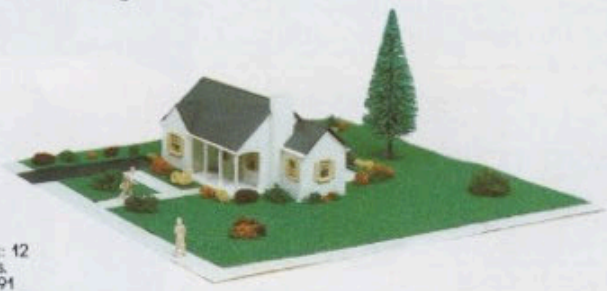
49-1986 New England Rancher $7.00