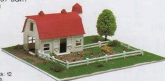
49-1987 Barn $7.00