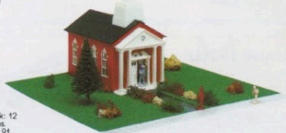
49-1984 Country Church $7.00