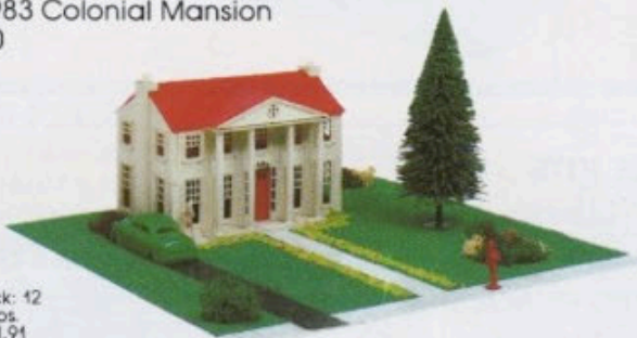
49-1983 Colonial Mansion $7.00