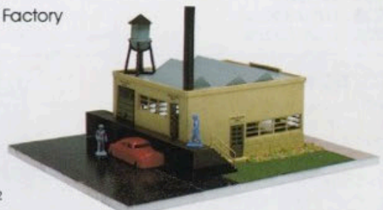
49-1988 Factory $7.00