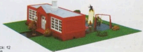
49-1982 School & Playground $7.00