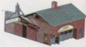
2909 Livery Stable and Blacksmith