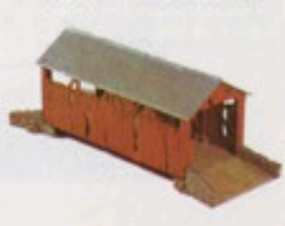
1920 Covered Bridge