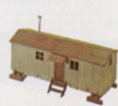
1917 Railroad Work Car