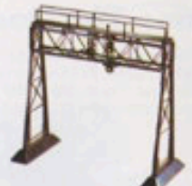
1815 Signal Bridge