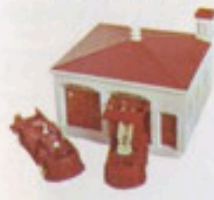
1921 Fire House and Two Fire Trucks