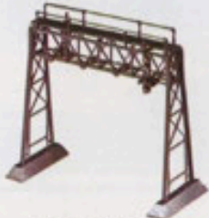
2620 Signal Bridge