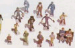
1915 32 Citizens with Paints