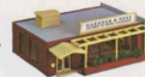
2905 Men's Store