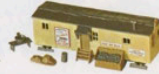
2811 Railroad Work Car