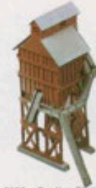
2808 Coating Station