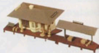
2806 Suburban Station