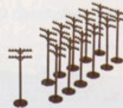
1630 Telephone Poles (12 pieces)