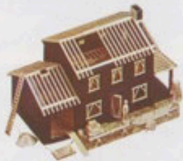
2903 House Under Construction