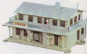
2912 Saloon and Barber's Shop