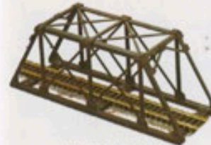
2810 Trestle Bridge (Track not included)