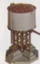
1916 Water Tank