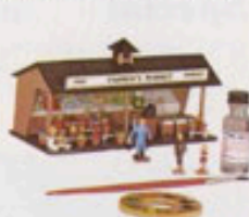
1923 Roadside Stand with Paints