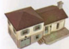
1906 Split Level