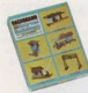
1605 Five Kit Assortment