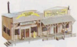
2913 General Store and Bank