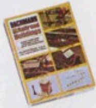
2040 Six Kit Assortment