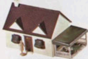
2617 Cape Cod House