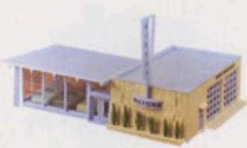
2907 New Car Showroom