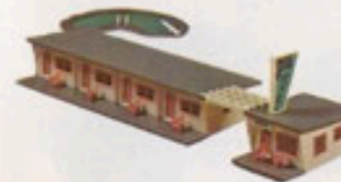
2903 Motel with Swimming Pool

• Styled after authentic American prototypes