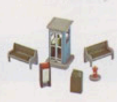
1918 Park Assortment (33 pieces)