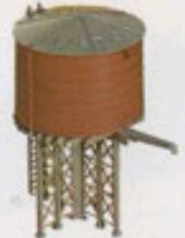
2812 Water Tank