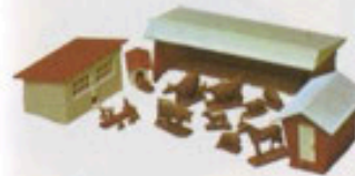
2813 Farm Buildings and animals