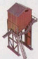
1975 Coaling Station