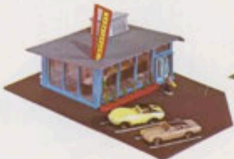
2916 Drive-in Hamburger Stand