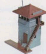
1814 Switch Tower