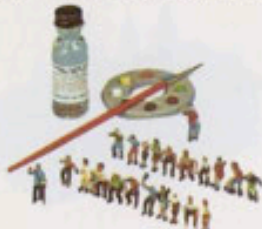
2914 24 Sitting People with Paints