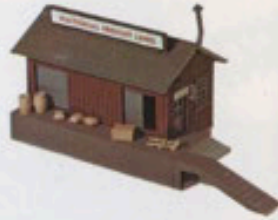
2610 Freight Station