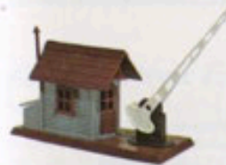
1816 Watchman Shanty and Gate