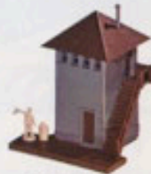
2619 Switch Tower