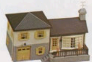
2901 Split Level House

• Styled after authentic American prototypes