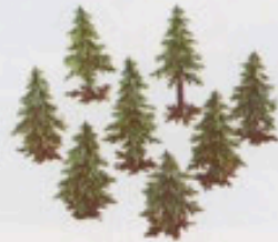
2621 Pine Trees