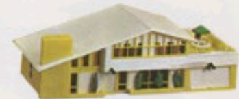
2906 Contemporary House