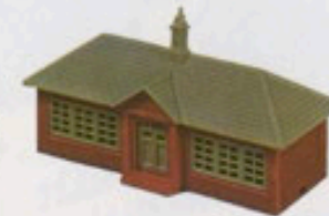
2814 School House