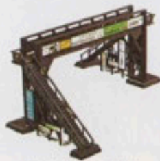
2805 Pedestrian Bridge