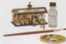
2923 Roadside Stand with Paints