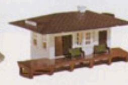
1911 Suburban Station