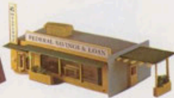
2922 Drive-in Bank