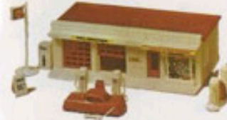
2807 Gas Station