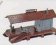
1817 Loading Platform