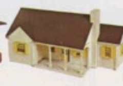
1912 New England Rancher