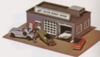
2915 Auto Body Repair Shop