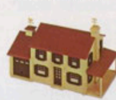
1922 Two Story House