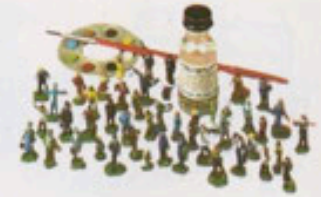
2809 48 Citizens with Paints