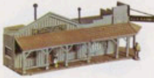
2911 Marshall's Office and Restaurant