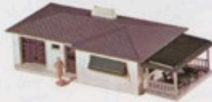
2618 Ranch House