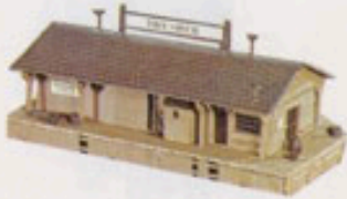
2910 Old Time Station